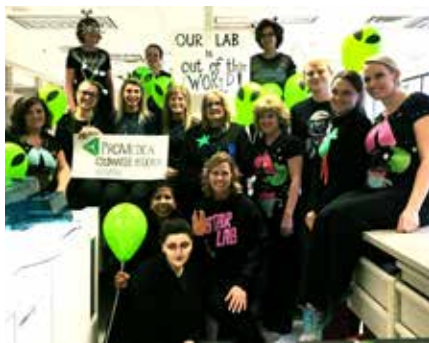
THIRD PLACE CHCBC - Laboratory Far, Far Away