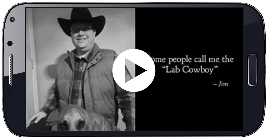
FIRST PLACE VIDEO Deaconess Regional Laboratory - The Lab Joker