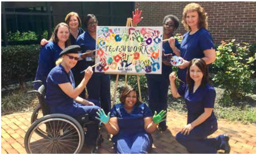
FIRST PLACE Vidant Health - TEAMWORK: We all have a hand in the masterpiece