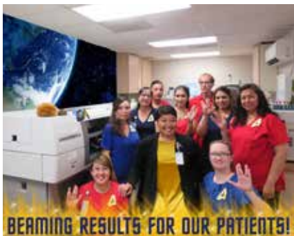
SECOND PLACE SLFHC - Sun Life Lab